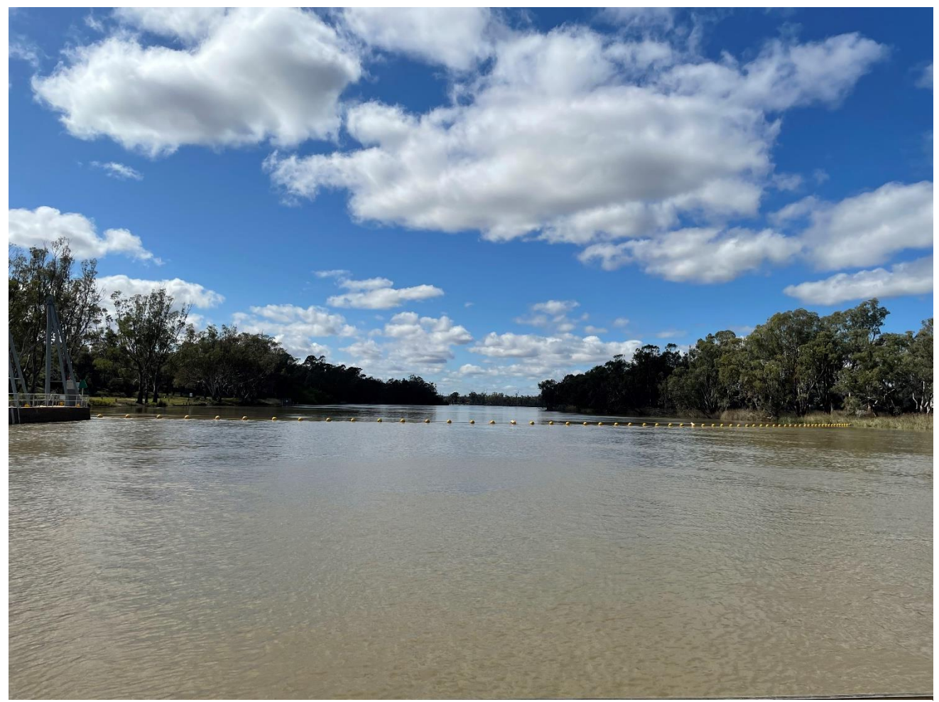
Figure 1: Blue skies and high flows at Lock 2 (looking upstream)

** Water levels will lower, however once the weir is removed and river flows increase, water levels will increase again with natural flow variation.